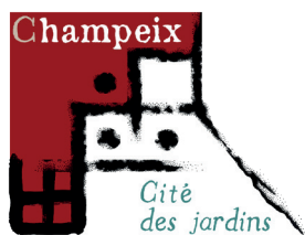
Ville de Champeix