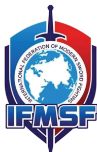
International Federation of Modern Sword Fighting

The department of Puy-de-Dôme closely follows our activities and helps us with grants and support in our development efforts.